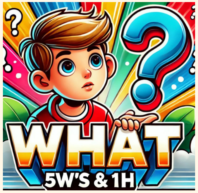
This question encourages you to identify the main subject matter and clearly communicate the purpose of your content.

2. What: The "What" question delves into the heart of your content by defining the central theme, problem, project solution, or concept you aim to address.